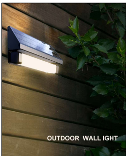
OUTDOOR WALL LIGHT